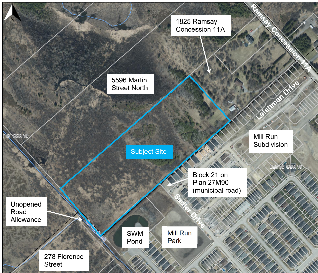
Figure 3: Subject Site and Surrounding Area